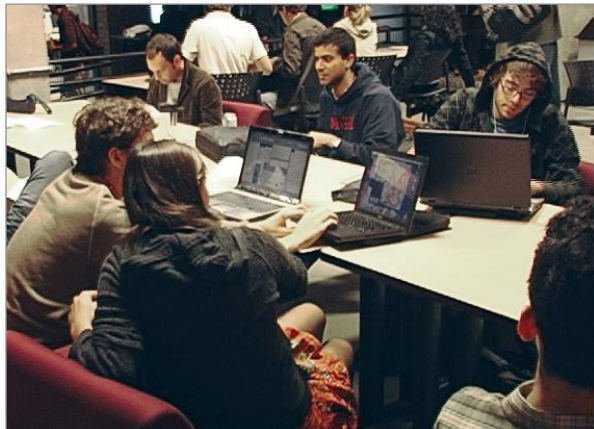
McGill's student lounges offer a convenient place for wireless access between classes.

Upgrades to the IOS (internetwork operating system) of the Aruba software over the summer 2007, enabled features that provided identity-based authentication through WPA (Wi-Fi Protected Access).